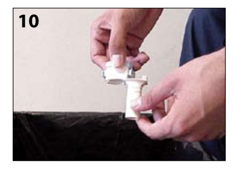
Open mouthpiece of Aerolizer®, and dump the capsule directly into a trash can. Do not touch the capsule. Put the mouthpiece cover back on the Aerolizer®.

The American College of Chest Physicians is the leading resource for the improvement of cardiopulmonary health and critical care worldwide. Its mission is to promote the prevention and treatment of diseases of the chest through leadership, education, research, and communication.