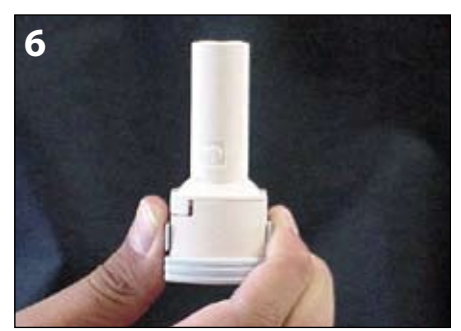
Hold the Aerolizer® with mouthpiece straight up. SQUEEZE THE TWO BUTTONS AND LET GO. This releases the medicine.