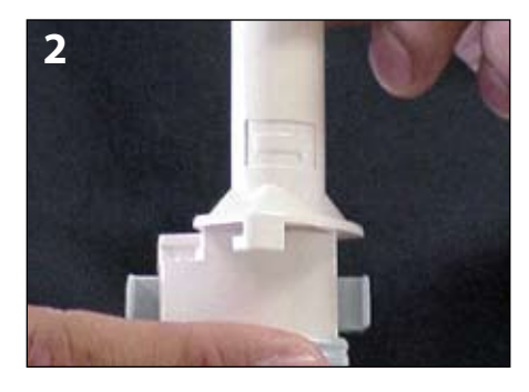
Twist mouthpiece open in the direction of the arrow.