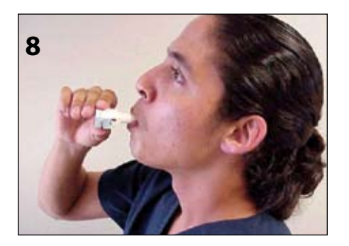
Tilt your head back slightly. Place the Aerolizer® between your lips, and form a tight seal. Make sure the buttons are on the sides, not up and down. BREATHE IN FAST AND DEEP. As you breathe in, you will hear the Aerolizer® vibrate.