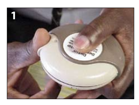
Hold Diskus® in one hand, and put the thumb of your other hand on thumb grip.

To make your breathing better, you MUST take your medicine as explained below. Following these instructions puts more of the medicine into your lungs. This will open your air passages and help you breathe easier and feel better.