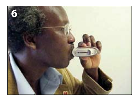
Put mouthpiece between your lips and make a tight seal. BREATHE IN FAST AND DEEP.

3300 Dundee Road, Northbrook, IL 60062 (847) 498-1400 phone (847) 498-5460 fax www.chestnet.org