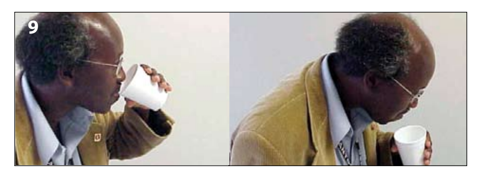
Rinse your mouth with water. Spit the water out; do not swallow it. Rinsing is only necessary if the medicine you just took was a corticosteroid, such as Flovent <sup>®</sup>.

The American College of Chest Physicians is the leading resource for the improvement of cardiopulmonary health and critical care worldwide. Its mission is to promote the prevention and treatment of diseases of the chest through leadership, education, research, and communication.