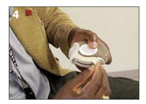
Slide lever away from you as far as it will go. You will hear a click. The medicine is now ready for you to breathe in. DO NOT TIP YOUR DISKUS®. YOU MAY LOSE THE DOSE OF MEDICINE.