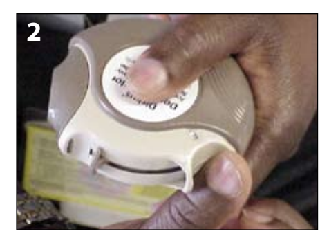
Push your thumb away from you as far as it will go. The mouthpiece will appear and will click into place.