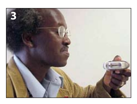
Hold Diskus® level with mouthpiece facing you.